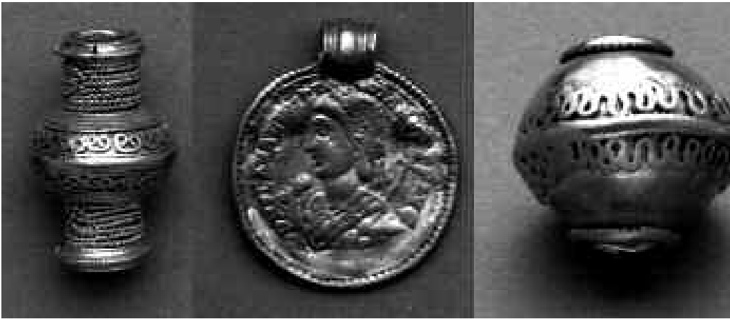
Fig. 6. Selected pieces from a gold hoard found folded into a Roman silver plate at Sorte Muld on Bornholm. A: tubular spacer bead. B: solidus coin with simple loop. C: spheroid spacer bead. All shown at slightly different scales.

berg, Färjestaden and Möne, and also gold bracelets and parts of necklaces found in Denmark, are made of row upon row of similar filigreed tubes.