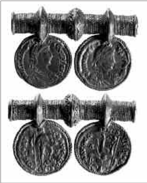
Fig. 2. Gold pendant with solidi found in 1906 at Udovice. Length 48 mm. A: averse. B: reverse.