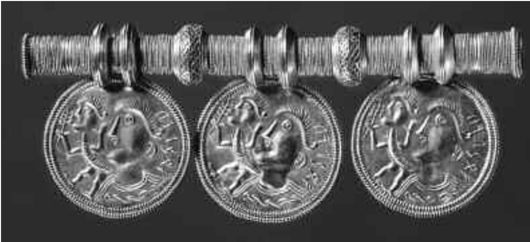
Fig. 4. Gold pendant with bracteates found at Kongsvad å on Zealand.