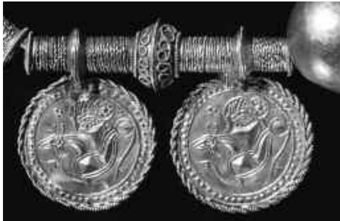
Fig. 5. Gold pendant with bracteates found at Stenholts vang on Zealand.

peltae at the middle of the tube ( Goldbrakteaten 1985, pp. 180–181, no. 101; 308–309, no. 179; Taf. 128, 233; Jørgensen & Vang Petersen 1998, pp. 240, 243). The design of these tubes and the way the bracteates are fastened to them is entirely analogous to the Udovice pendants. Indeed, the ring-shaped filigree-wire edge-trim of Scandinavian bracteates in general is often identical to what we see at Udovice.