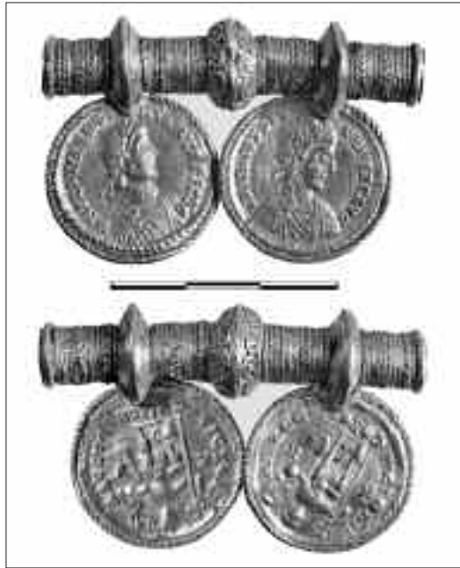
Fig. 3. Gold pendant with solidi found in 1925 at Udovice. Length 48 mm. A: averse. B: reverse.

solidi are orientated so that the Emperors' portraits are approximately right-side-up when the tube is held horizontally.